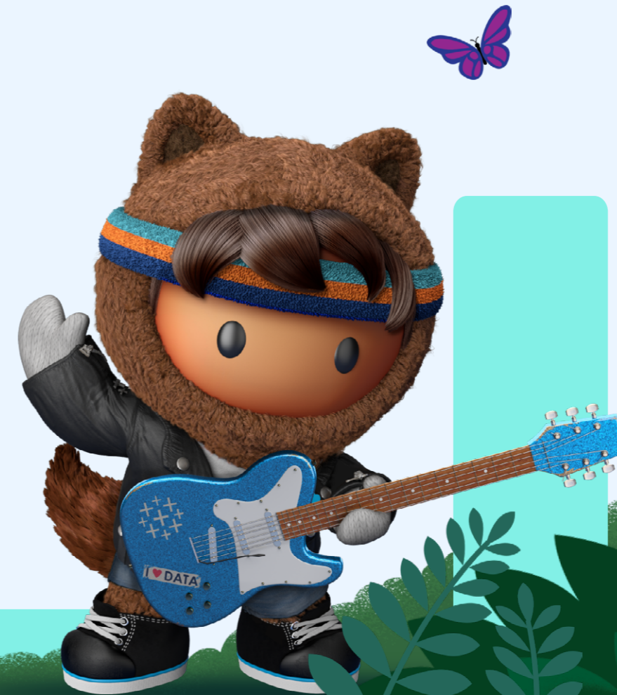
Tableau empowers CSPs to deliver greater customer satisfaction with data