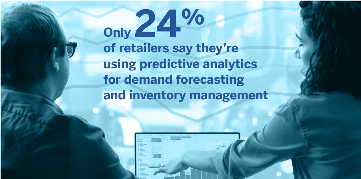
Source: "Meeting Adversity with Data," Retail and Consumer Goods Analytics Study 2020

By analyzing historical inventory data to trace patterns of customer behavior, the retailer could use forecasting analytics to provide direction on how to best provision individual locations going forward. This new clarity helped the organization better understand all of its customers and plan accordingly.