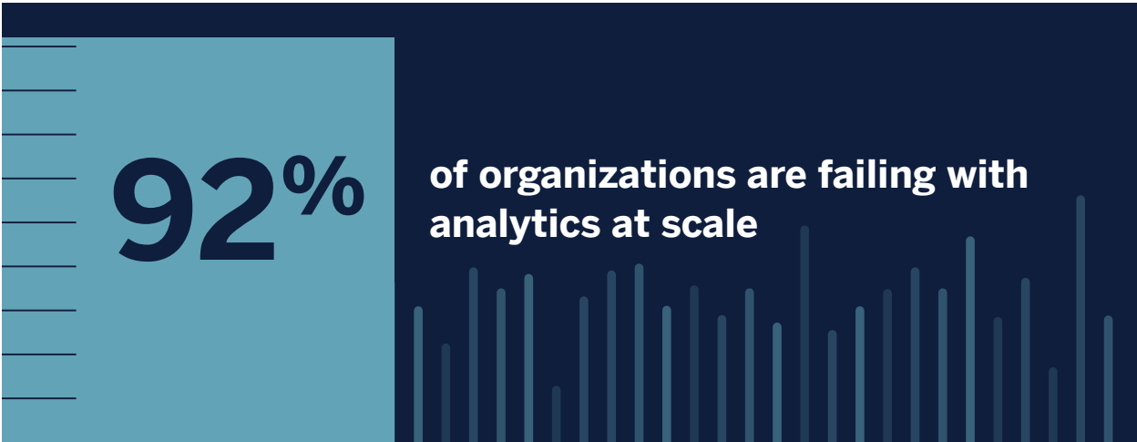
Source: “Catch them if you can: How leaders in data and analytics have pulled ahead,” McKinsey, September 19, 2019

Moreover, the solution advances real-time collaboration among retail partners by utilizing “clean rooms” to enable rule-based, permissioned sharing of data sets. Vendors can designate which portions of each data set are visible to each company—providing end-to-end visibility into the supply chain while maintaining strong governance and security.